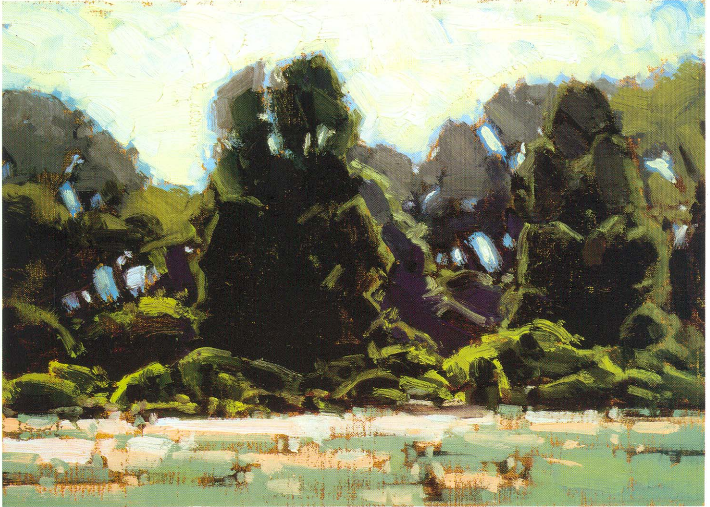
"Summer Tree Line," oil, 12" × 16"

Not everyone is free to spend time in desert or high mountain wilderness terrain. And even if they could, not everyone has the patience, the practiced eye, or the sense of wonder required to notice exquisite beauty in often small and unassuming spots.