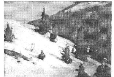
"Sunny Slope in the High Country" 9 x 12 Oil on Linen

"The light changes so quickly," he says of the desert light. "From 8 to 11 in the morning there is a completely different light."