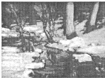
"Where the Light Comes In" 9 x 12 Oil on Linen