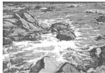
"Pacific Coast" 9 x 12 Oil on Linen