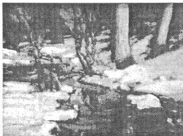
"Where the Light Comes In" 9 x 12 Oil on Linen