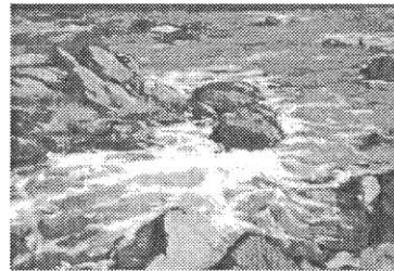
"Pacific Coast" 9 x 12 Oil on Linen