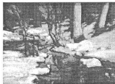
"Where the Light Comes In" 9 x 12 Oil on Linen