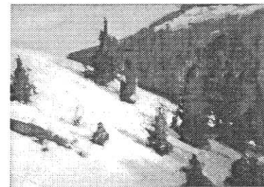
"Sunny Slope in the High Country" 9 x 12 Oil on Linen

graceful way he loosened his grip on this realm. He taught me that awareness is in a constant state of change and deathless. His mantra was peace, beauty and love.