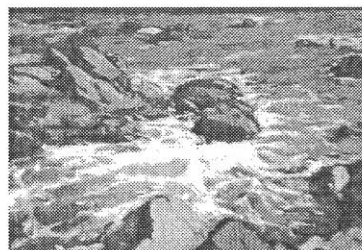
"Pacific Coast" 9 x 12 Oil on Linen